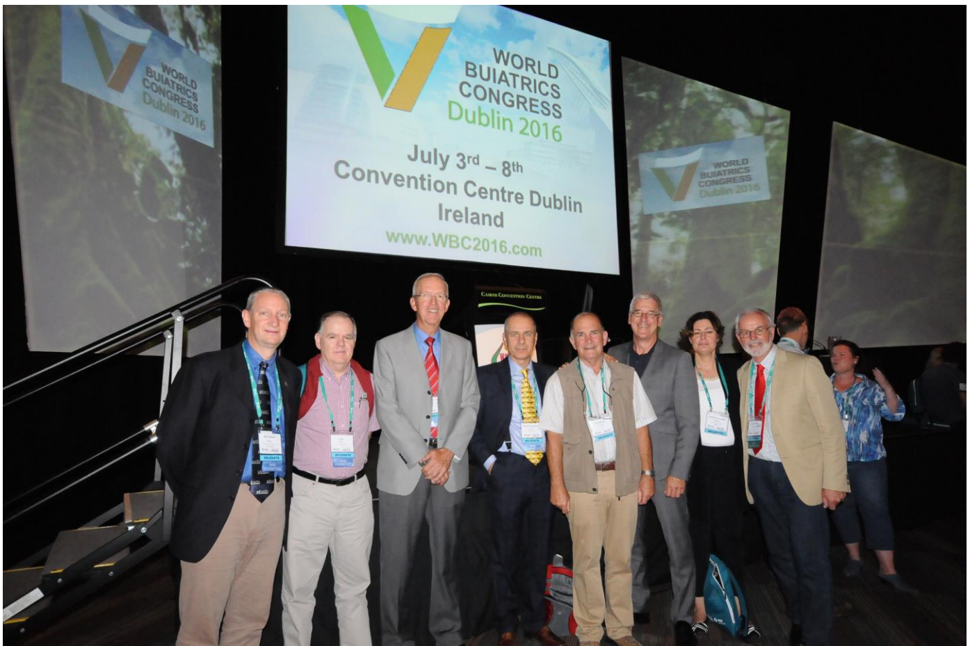
Some executive committee members of the WAB at the end of the XXVIII WBC in Cairns